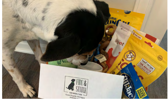
A Happy Pet with His Gift Basket From Courage, Comfort & Cocktails